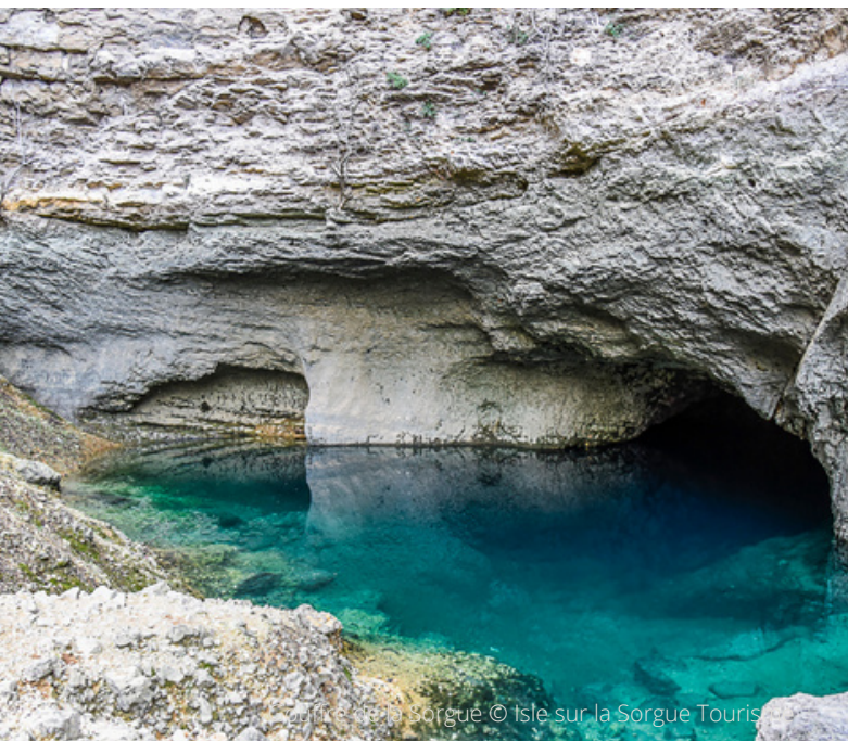
Fontaine de la Sorgue

Walking in the Luberon and the Monts de Vaucluse is a great way to experience both nature and history. Hiking paths criss-cross the region in all directions. There are marked hiking trails conducive to challenging hikes, and to walks with the family and among friends. If you are up for a longer hike, you can cross the Luberon/Monts de Vaucluse area from north to south or east to west in two days.