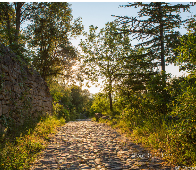
Giraut © OT LMV