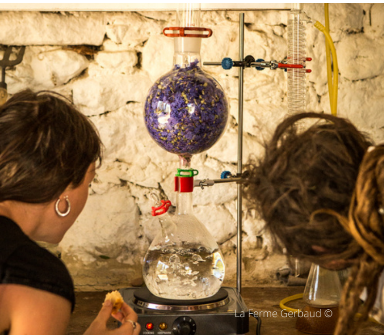
La Ferme Gerbaud ©