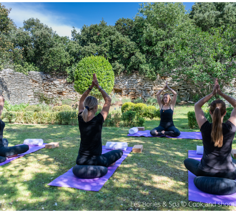
Les Bories & Spa

Take the time to relax peacefully and recharge your batteries as you make the most of our spa centres, with their facilities dedicated to pure pampering. Spas, massages, relaxation areas are available throughout the Luberon.