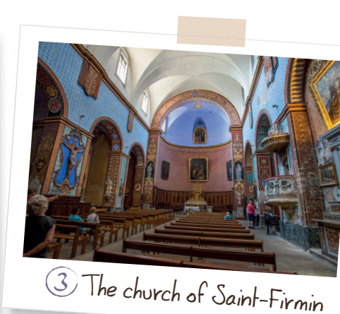
③ The church of Saint-Firmin