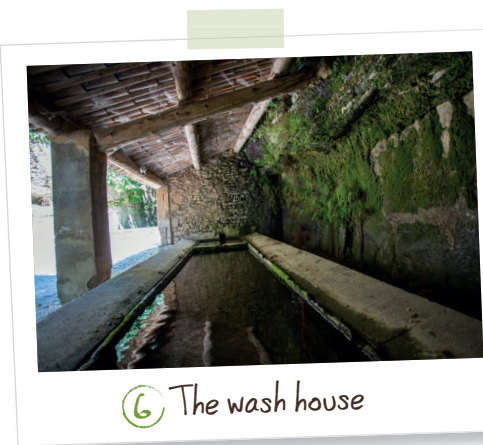
⑥ The wash house