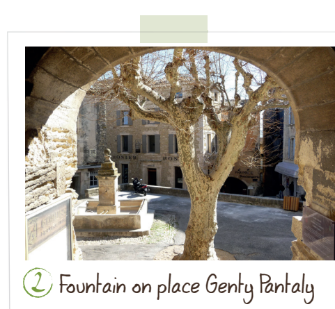
② Fountain on place Genty Pantaly