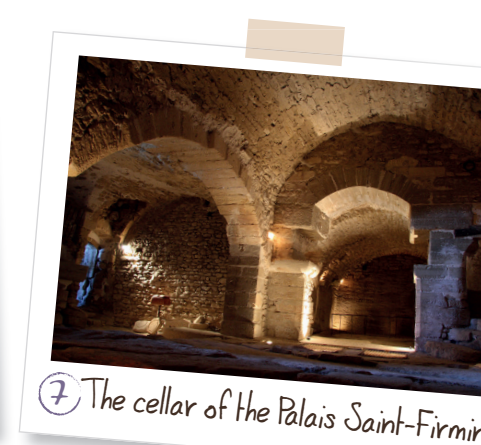
⑦ The cellar of the Palais Saint-Firmin