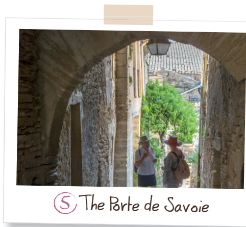
⑤ The Porte de Savoie

www.caves-saint-firmin.com Admission charge