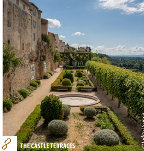
8 THE CASTLE TERRACES