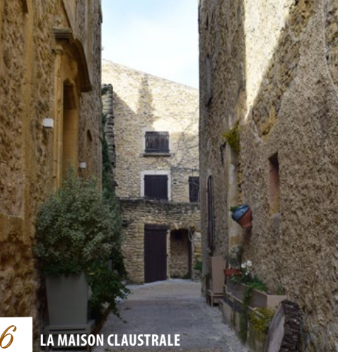
6 LA MAISON CLAUSTRALE