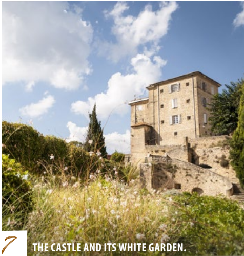
7 THE CASTLE AND ITS WHITE GARDEN.